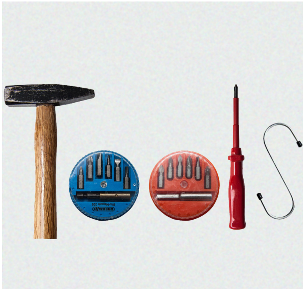
THE WRITER'S TOOLBOX What you need to master the craft